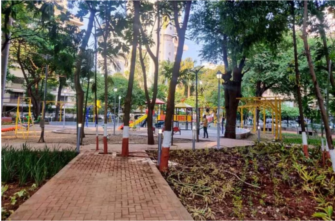
Renovated park with accessible, tree lined paths