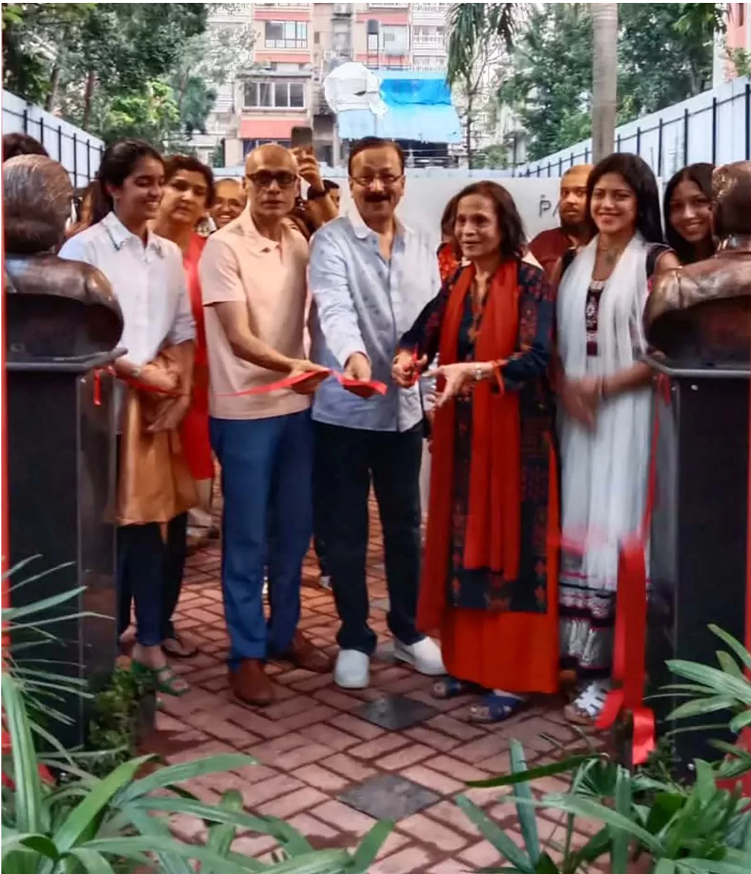
Reopening the Prof. d'Almeida Park, 24 October 2022