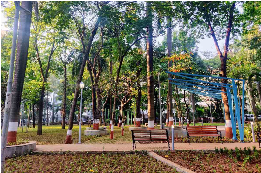
New benches at intervals in the renovated park